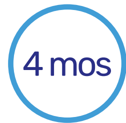
Average Time-To-Value Forest & Wood Product Partners

Augury diagnoses the forestry and wood products industry's most critical assets.