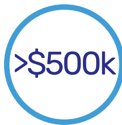
Downtime costs avoided eight months after deployment Leading Forest Products Company